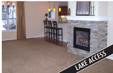
03451 COMMODORE, EAST JORDAN Virginia Ledge stone gas fireplace in living room, a brick wood burning fireplace in family room and a wet bar with refrigerator, aple cabinets, granite countertops, hardwood floors and stainless steel appliances, plus a butler pantry with wine cooler and granite countertop. Lake Charlevoix access!! MLS 432758. Ask for Mike Stark. $199,900