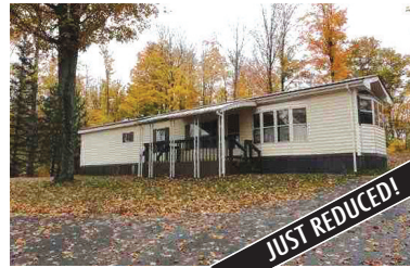
4087 SCOFIELD ROAD, EAST JORDAN This is a great mobile home that has been very well cared for and maintained over the years. A very picturesque setting on just over 6 acres. Home features country views that are quite peaceful. Don't be afraid to make an offer on this one! MLS 435201. Ask for Jennifer Burr. $39,000