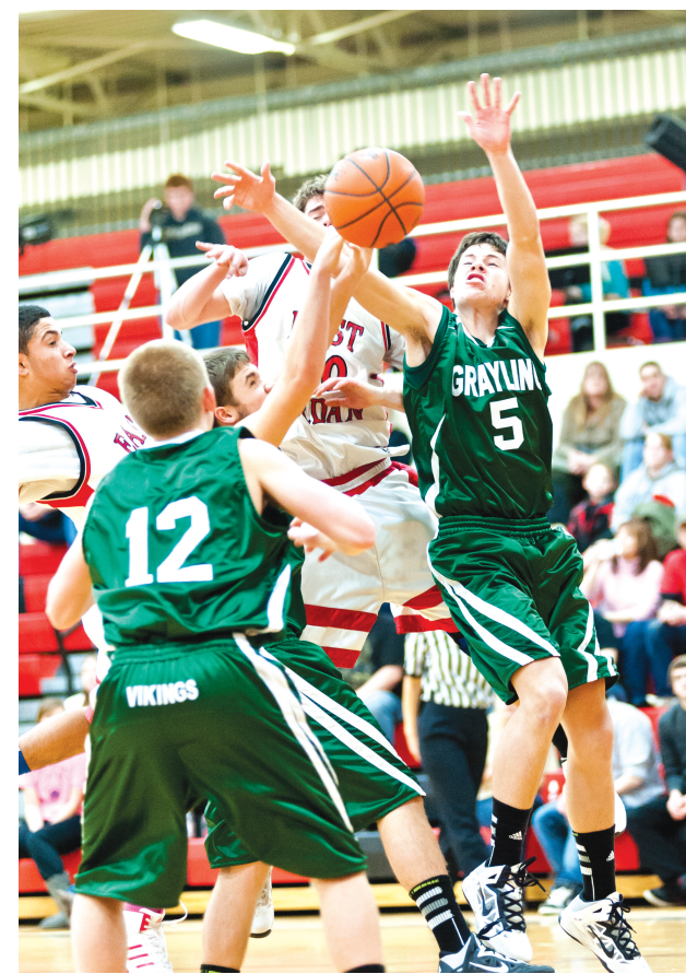
The Red Devils and Vikings battle in the paint for this rebound attempt.