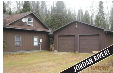
2452 MARTINSON DRIVE., EAST JORDAN Fantastic home and location for those who want privacy, access to the river and snowmobile trails. Beautiful frontage on the famed Jordan River allows for fishing or canoeing from your front yard. Pole barn for extra storage room. This would make a perfect primary or second home. MLS 435491. Ask for Mike Stark. $159,900.