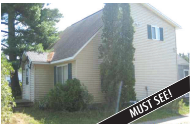
320 OLD STATE ROAD., BOYNE CITY Great location! close to town, yet just out of the way off the main road. Large kitchen with lots of cabinet space, as well as a large combo dining/living area. The acreage gives room to add or expand as well. MLS 432586. Ask for Mike Stark. $69,500