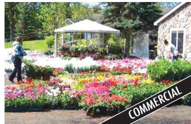
401 WATER ST., EAST JORDAN You know you have always wanted to have a flower shop...so here's your chance! What an opportunity it is! Established business with real estate included and LOTS of room for expansion into additional landscaping and gardening, if desired. HIGH exposure location and great parking available. Upper level apartment with 1 year lease. All store fixtures and most inventory will go with sale. MLS 435319. Ask for Sara Schroeder. $150,000.

109 MILL STREET • EAST JORDAN • 231-536-7700