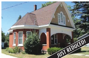
705 PROSPECT ST., EAST JORDAN Turn of the Century home with architectural charm! This home has recently had extensive remodeling and is ready for you to move right in! Beautiful wood floors, an updated kitchen, a formal dining room for entertaining, as well as a newer furnace and roof! Close to schools and downtown for your conveniences! Call to see today! MLS 430906. Ask for Jennifer Burr. $85,000.