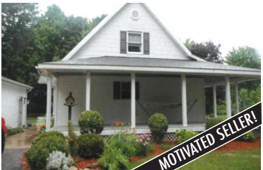
300 NORTON STREET, EAST JORDAN Large wrap-around porch, open living spaces, large bedrooms, finished full basement with family room and office/play area and partially wooded lot all located just a stone's throw from the public beach. 2 car garage and an additional garage for "toy" storage and paved drive. MLS 434537. Ask for Mike Stark. $175,000