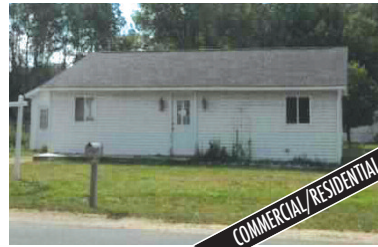
502 MAPLE, EAST JORDAN Although zoned C-1 for small business, this was previously used as a home and City says can still be. Detached garage with gas heater and a large corner lot! Very convenient location. Close to grocery store, schools, community park and downtown. Additional parcel in back is also available which provides room for a pole building. MLS 435252. Ask for Mike Stark. $54,900