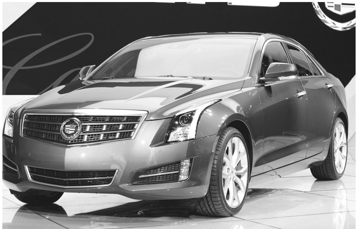
The Cadillac ATS wins the North American Car of the Year Award Monday, January 14, 2013 at the start of the North American International Auto Show in Detroit, Michigan.