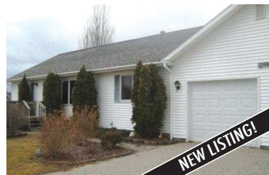
5035 LIT'L PINEY DRIVE., CHARLEVOIX Wow! Turn key home in a great subdivision just south of Charlevoix. Nice ranch style floor plan with master suite at opposite end from other 2 bedrooms. Features include a nicely appointed kitchen and a full basement- and half of the basement is finished off with tongue and groove paneling. This one is move-in ready and priced to sell! MLS 435653. Ask for Mike Stark. $109,900.