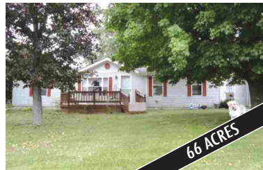
10132 LA CROIX RD., EAST JORDAN Slightly rolling country side, mixed with some hardwoods and pines, makes this home with 66 plus acres appealing! Manufactured home features a breeze way addition attaching the garage as well as a 30 x 40 pole barn for storage or livestock. This one is priced to sell and won't last long! MLS 434964. Ask for Jennifer Burr. $184,900