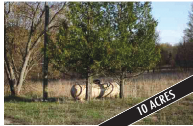
2235 VANCE ROAD • EAST JORDAN Beautiful location, hilly wooded with well, septic, and electric in place with a concrete slab. This view is a must see!! Great place to put a getaway cabin or a year round home. MLS 433118. Ask for Holly Nierman. $24,444