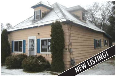
427 LEWIS STREET, BOYNE CITY Great opportunity for a project inside city limits. Large lot and close to down town area. MLS 435808. Ask for Mike Stark. $21,780