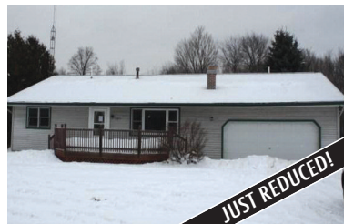
872 S M75 HIGHWAY. BOYNE CITY Large 4 bedroom, possibly 5, ranch style home on a full basement with 2 car garage sitting on over an acre of land. Convenient to Boyne City, Boyne Falls and Petoskey. Seller just had a new roof put on. MLS 435684. Ask for Mike Stark. $84,900